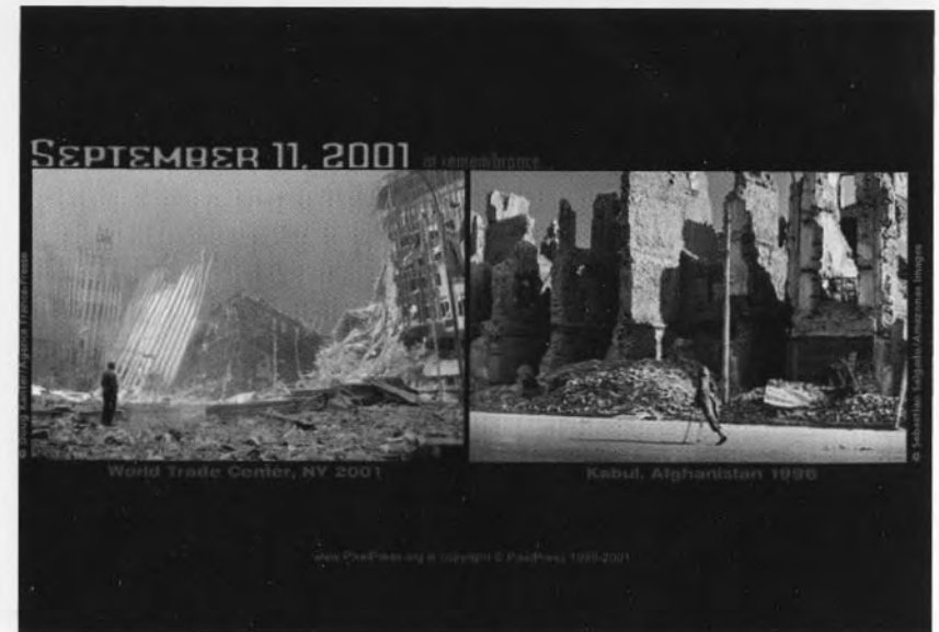
FIG. 35: PixelPress's Web site showed the similarities of the September 11th attacks in both Chile and Washington, D.C. (top), as well as the fact that Kabul, like the World Trade Center towers, had already been destroyed. At the time of publication the U.S. government was deciding whether to bomb Afghanistan.