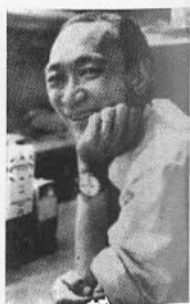
Brig. Gen. Nguyen Ngoc Loan in his pizzeria in Dale City, Virginia. Mr. Loan died in 1998

FIG. 31: If the reader clicked on the famous photograph of the execution of a member of the Vietcong, he or she could see the images that preceded and followed it. If the reader clicked on the man doing the shooting, he or she could find out that he later opened a pizzeria in Dale City, Virginia. Photographs by Eddie Adams / Associated Press.