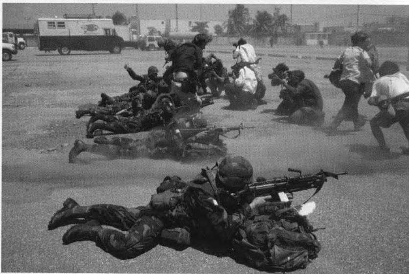
FIG. 34: The U.S. invasion of Haiti in 1994 as it was reported and the same scene viewed from the side. Perhaps in the future readers of Web-based publications will be able to place the cursor on the initial photo so that the contextualizing one emerges, providing a second interpretation as to what might have been going on. Bottom photograph by Alex Webb/Magnum.

People will better understand that a large percentage of photographs pretending to depict something significant are showing only its simulation, often created by the photograph's subjects themselves. The more powerful a subject is, the more he will control the simulation, while weaker and poorer people are often photographed to conform to generic but frequently less flattering imagery. A photograph that attempts to get at the complexity of individuals is considerably more rare. (A group of young Swiss photojournalists once told me that the goal of a portrait is to make the subject look nice.)